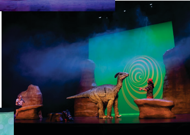
A Dinosaur Tale