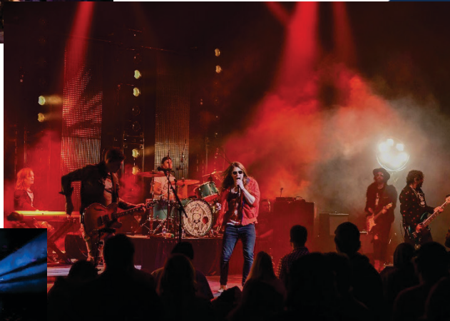
The Glorious Sons