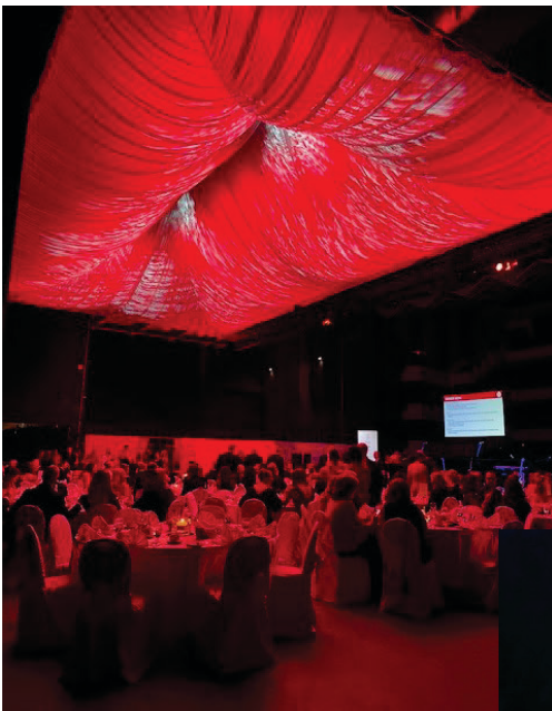
Red Cross: Red Gala