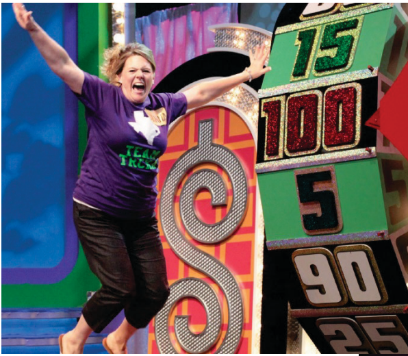
The Price is Right