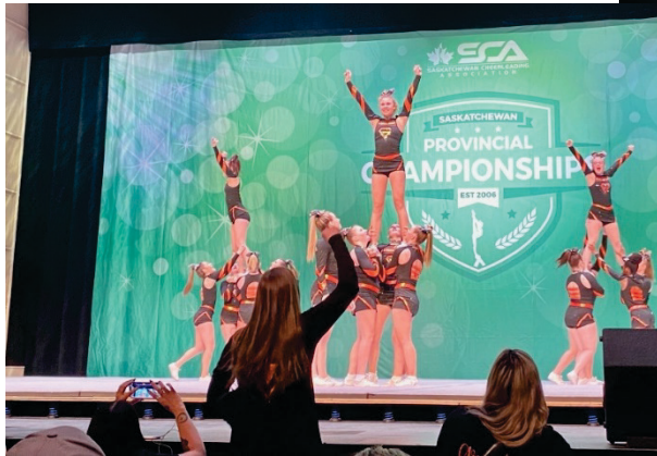
Saskatchewan Cheerleading Provincials