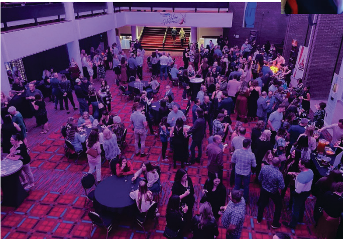
Wine in Wascana