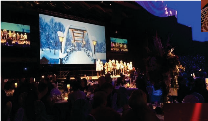
Hospitals of Regina 4 Seasons Gala